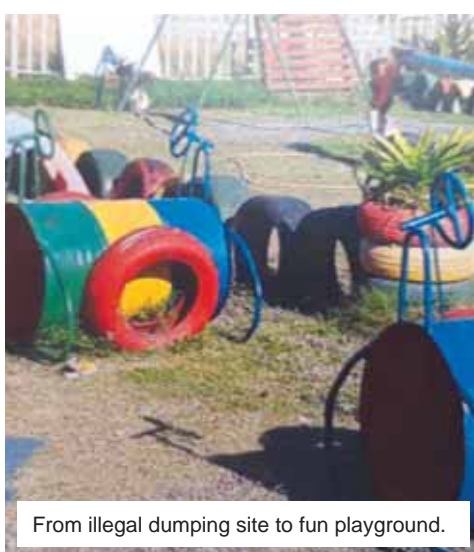
From illegal dumping site to fun playground.