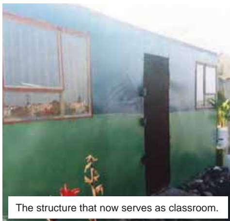
The structure that now serves as classroom.