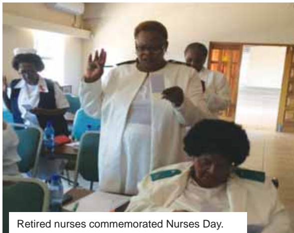
Retired nurses commemorated Nurses Day.