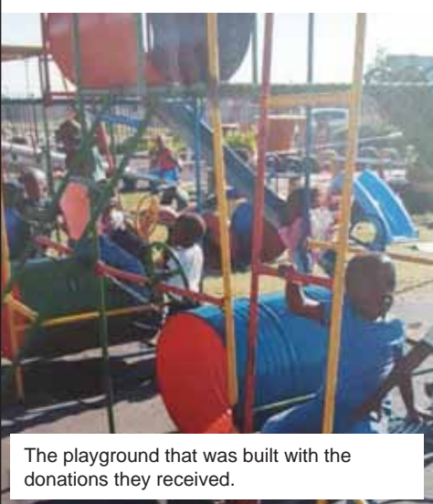
The playground that was built with the donations they received.