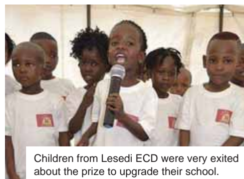
Children from Lesedi ECD were very excited about the prize to upgrade their school.

The R100,000 donation will make a striking difference to the Lesedi ECD Centre and their exciting upgrade plans include making essential building repairs; replacing the current pit toilet system with sanitary toilets; purchasing office, kitchen and gardening equipment; and boosting the educational toys available in the classrooms.