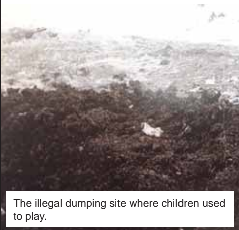
The illegal dumping site where children used to play.

They now have a company that is willing to donate groceries, but unfortunately, they don't have a place to store or cook the food. The school desperately needs a new structure for this. For more information contact Paulina on 071 294 0823.